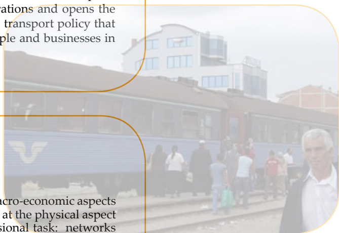
Express train to Skopje, stopping in Ferizaj/Urosevac